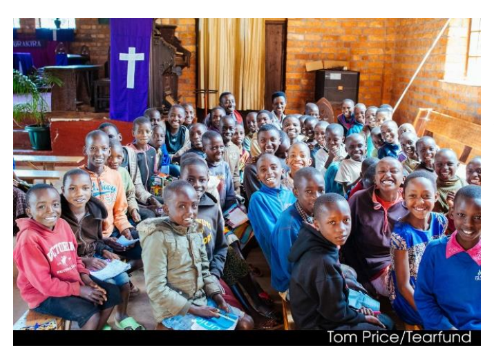
p.26 ' A Miraculous Homecoming')

When communities are empowered to overcome poverty, that's precisely what they'll do. Tearfund's church-based partners help people access the material things they need to survive. But they don't stop there. They offer spiritual hope through God, loving the whole person. (See Tear Times