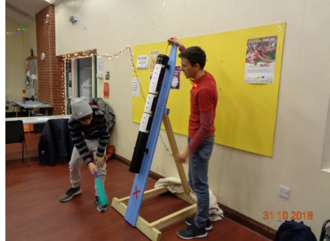
Cover the coins. Not as easy as you think!