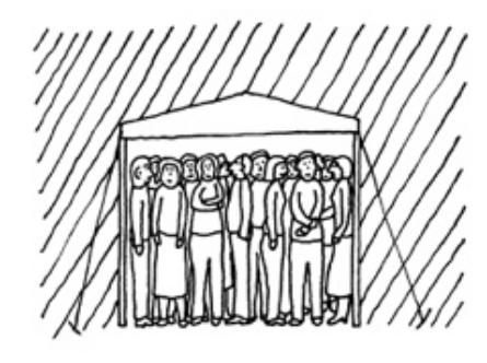
PARISH PICNICS TAKE PLACE