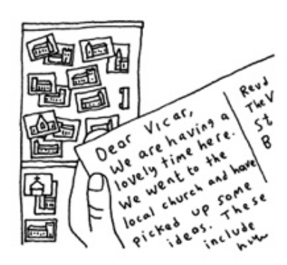
MEMBERS OF THE CHURCH SEND POSTCARDS