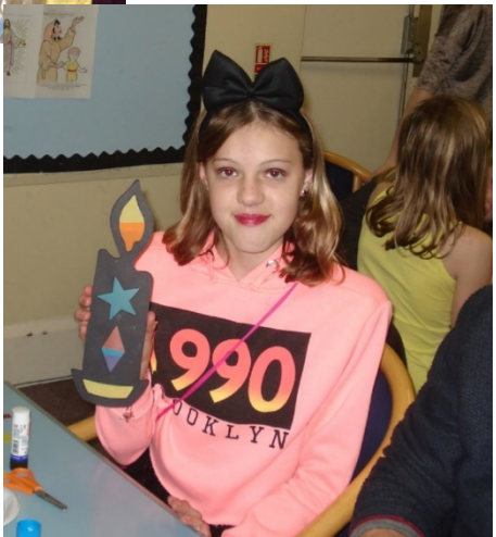
The finished product.... looking cool for a candle.

Some crafty business taking place... full of concentration.