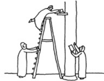
WORDS FROM THE INSTRUCTION BOOK ARE RECITED