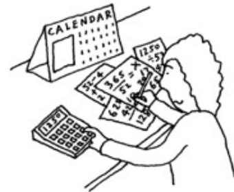
THE OFFICE IS REPEATED AFTER ANOTHER 1250 HOURS OF USE