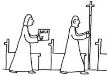
THE BOX IS CAREFULLY PROCESSED DOWN THE AISLE