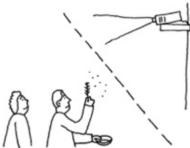
THE LAMP IS BLESSED AS IT IS SWITCHED ON FOR THE FIRST TIME